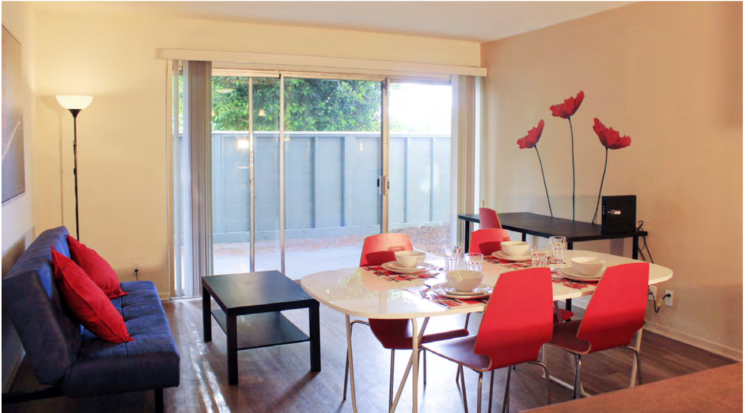
Living room area

Lincoln University offers student housing options. Currently, the university provides affordable shared dormitory style housing in the city of Alameda. The rent is starting at $695 per person monthly. These apartments are maintained and furnished by Lincoln University. The monthly rent includes utilities, high-speed Internet, and renter's insurance. The apartment complex offers controlled access, a pool, fitness center, laundry facilities, and is located near a bus stop within a short commuting distance from Lincoln University.