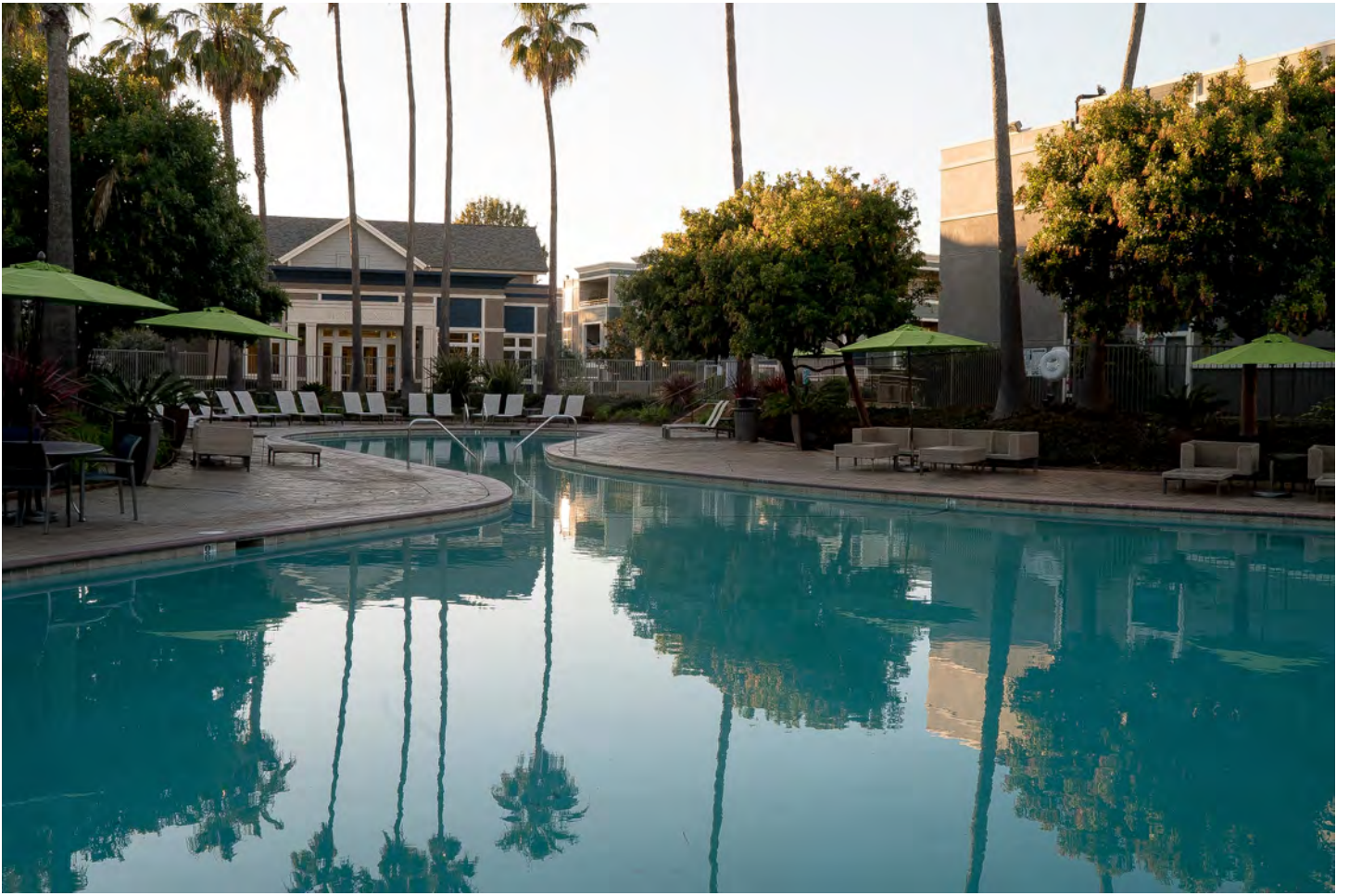
Swimming pool area