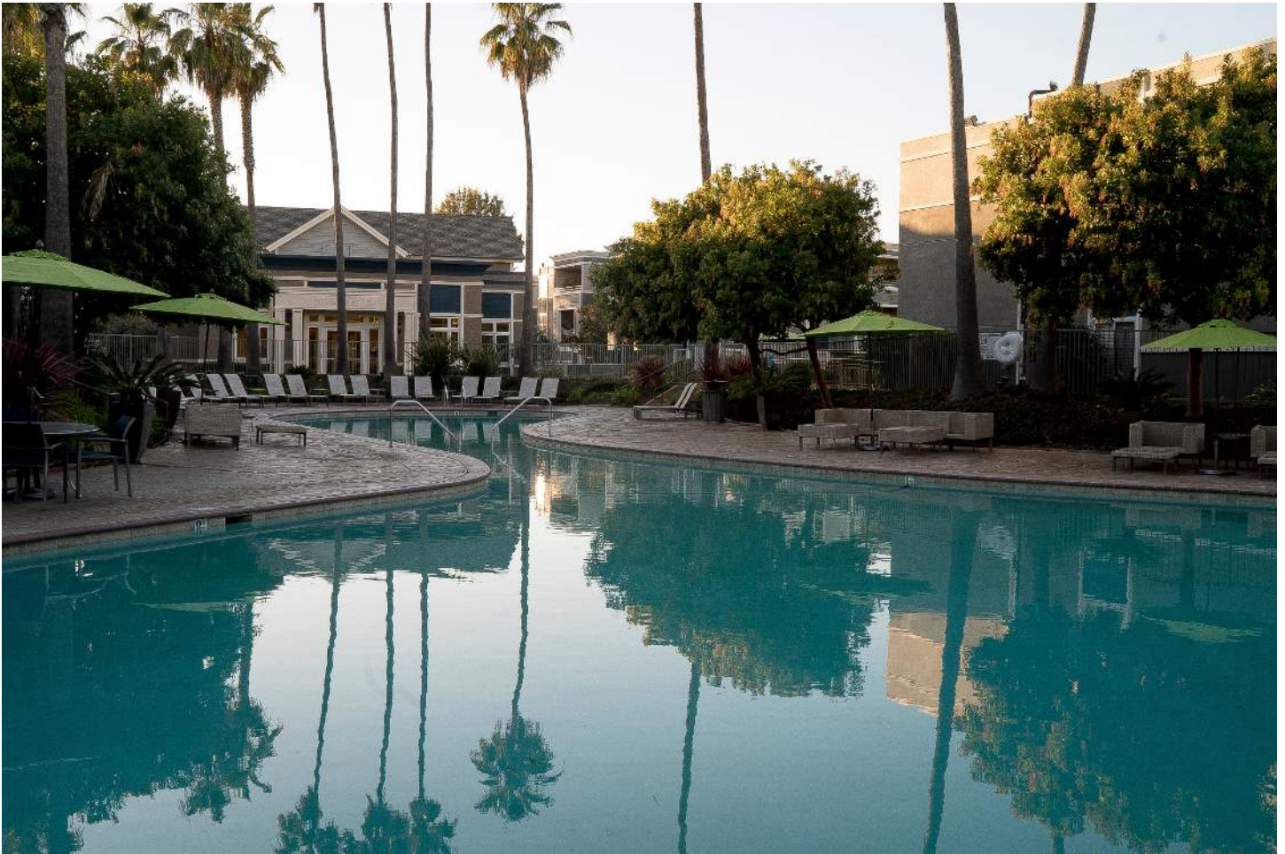
Swimming pool area