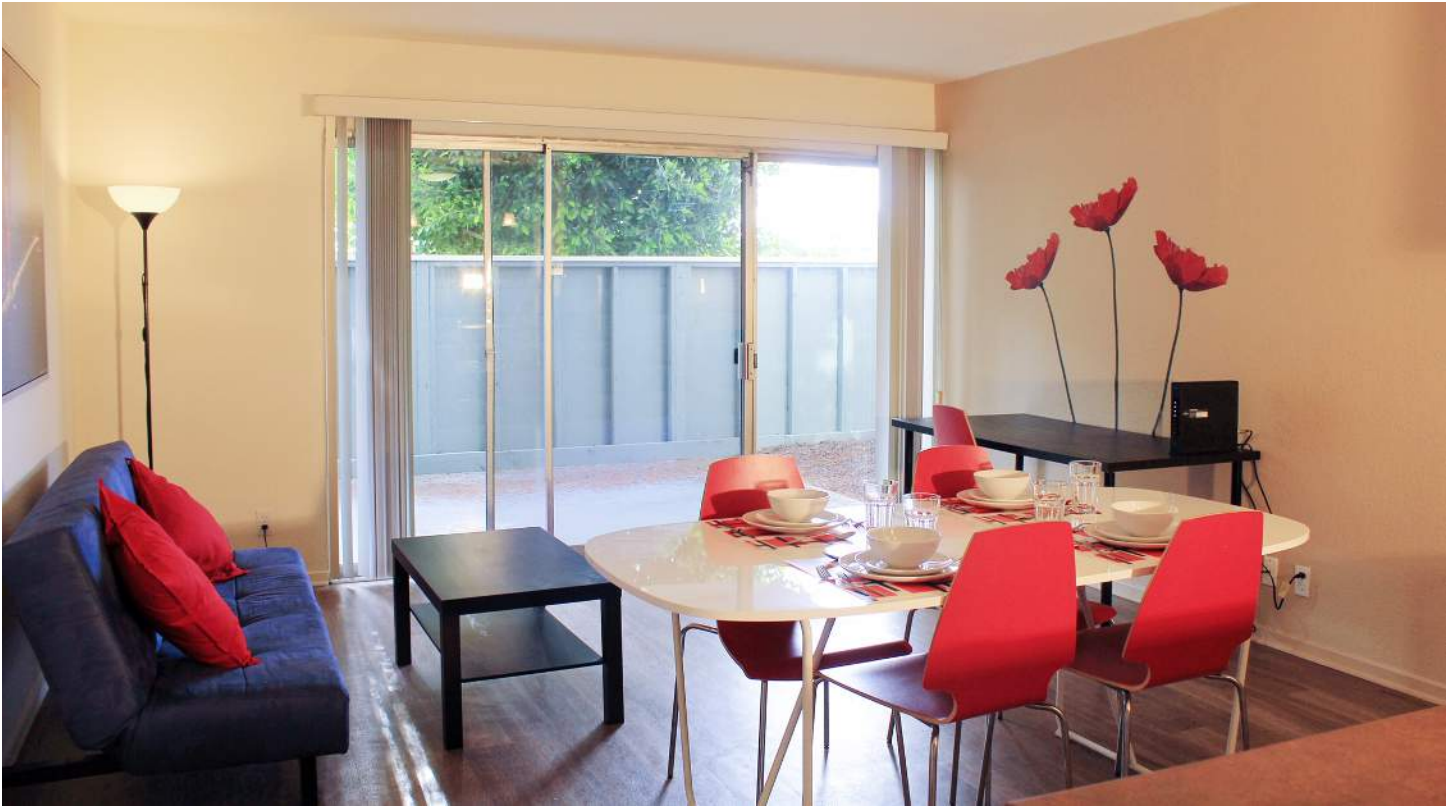
Living room area

Lincoln University offers student housing options. Currently, the university provides affordable shared dormitory style housing in the city of Alameda. The rent is around $600 per person monthly. These apartments are maintained and furnished by Lincoln University. The monthly rent includes utilities, high-speed Internet, and renter's insurance. The apartment complex offers controlled access, a pool, fitness center, laundry facilities, and is located near a bus stop within a short commuting distance from Lincoln University.